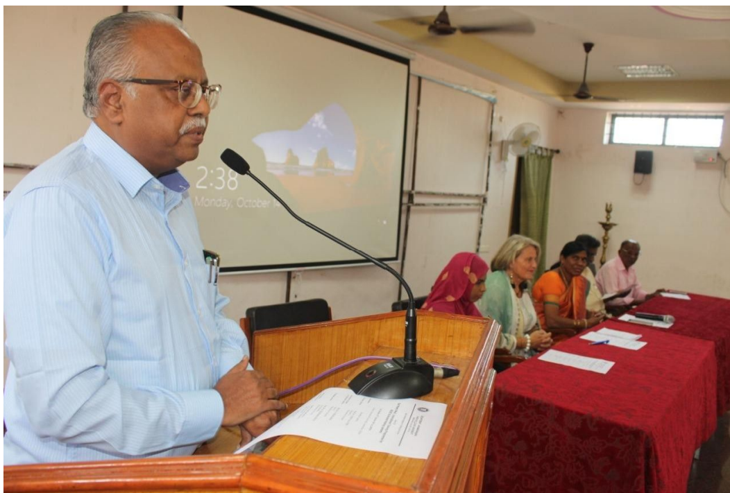
Most Respected Registrar, of Thiruvalluvar University presided and addressing the students of UGC/CSIR-NET Free Coaching Centre, Thiruvalluvar University (A State University), Serkkadu, Vellore - 2019-20.